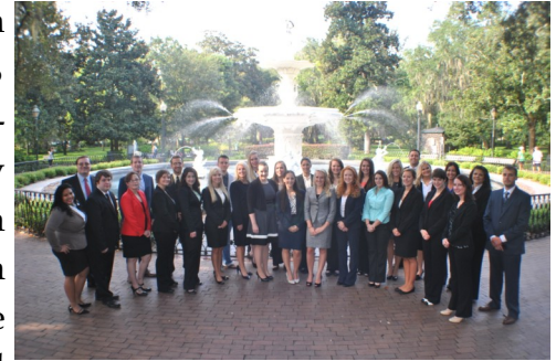
Savannah Law School Day Students

Savannah Law School is pleased to welcome its third entering class! With applications shrinking nationally at a rate of 8.2%, Savannah Law School bucked the trend again this year as applications to the law school increased by 18%. With a gender distribution of 71% female and 29% male, 21% minority representation, 17% military veterans, and a median age of 26, the 2014 entering class is Savannah Law School's most diverse; thus reinforcing the school's mission of providing the opportunity for legal education to both traditional and non-traditional students who show promise of making positive contributions to the profession, legal system or society.