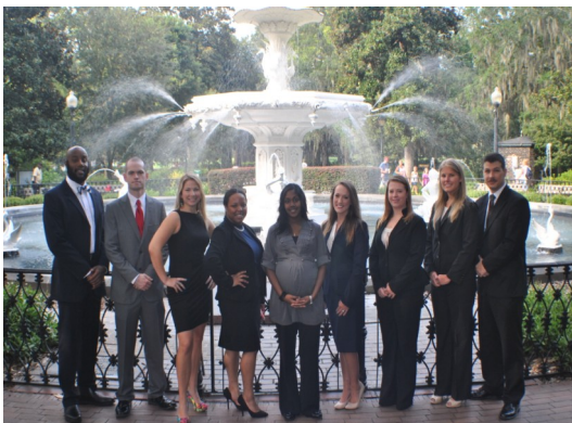
Savannah Law School Evening Students

Students joining the Savannah Law School community exemplify a variety of different backgrounds. 64% of incoming students come to Savannah from states other than Georgia, such as, Alaska, Arizona, California, New York, Ohio, Oklahoma, Maryland, South Dakota, Tennessee, and West Virginia. 33 different undergraduate institutions are represented, such as, Michigan State University, Texas Tech University, U.S. Military Academy, U.S. Naval Academy, and the Universities of Alabama, Alaska, Colorado, Georgia, Florida, Minnesota, North Carolina, and South Carolina. Students have also spent years serving throughout the world as Army and Naval Officers, business owners, teachers, kayak guides, musicians, athletes, and parents.