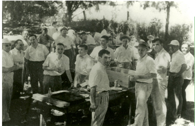
Savannah Bar Boat Ride, Dafuskie Island