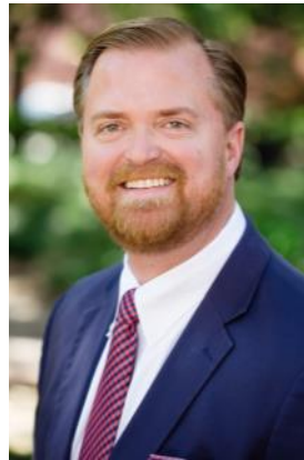
Christopher H. Smith Logistics