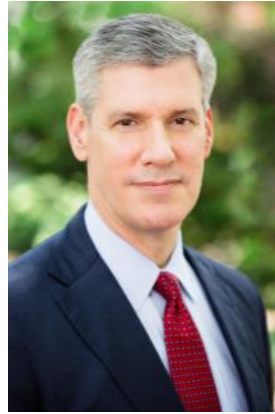
T. Mills Fleming Health Care