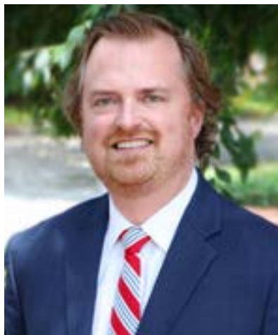
Christopher H. Smith