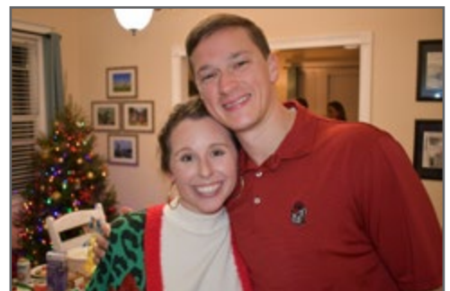
YLD Holiday Party