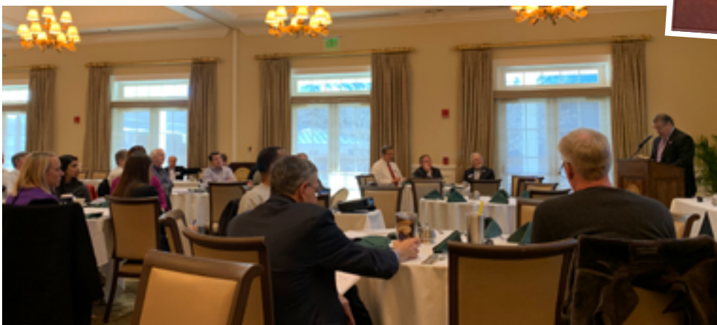
Left: SBA Hot Topic Event Photo