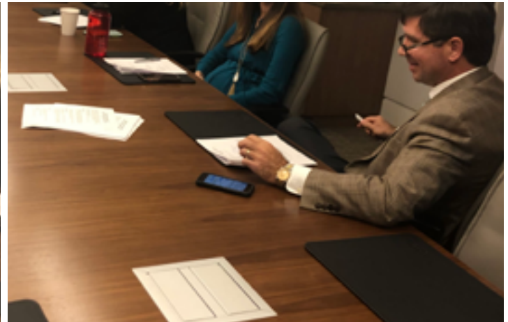
Your SBA executive board members hard at work at January monthly planning meeting.