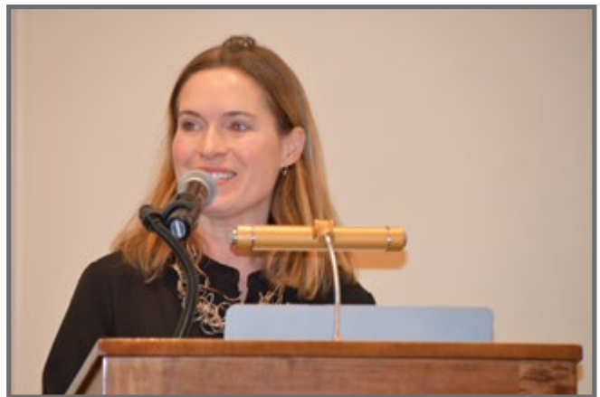
Judge Elizabeth Gobeil