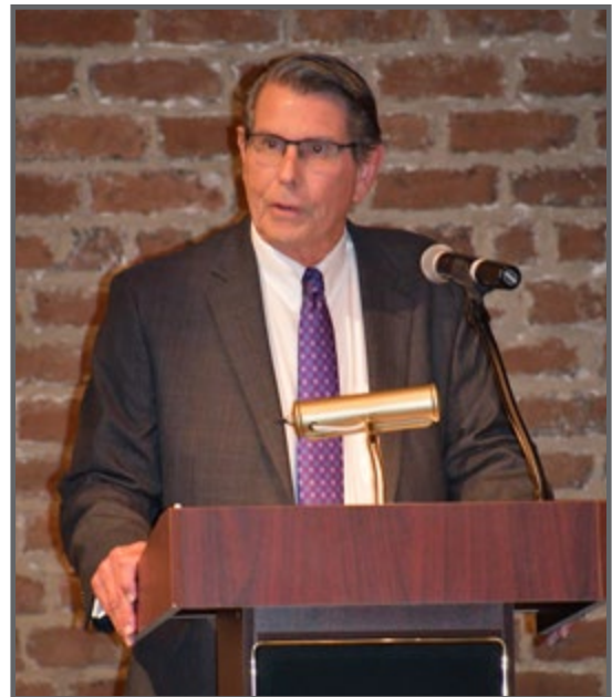
Judge Hermann Coolidge