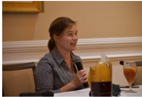
Judge Elizabeth Gobeil