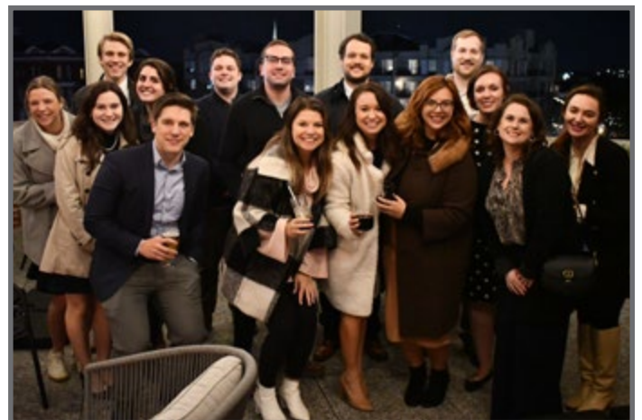
Alida Hotel Rooftop Bar