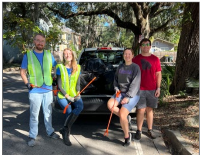
YLD Trash Pickup