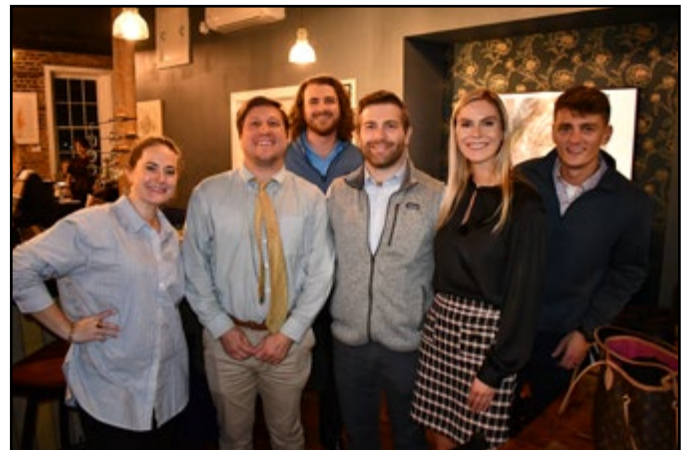
YLD Happy Hour