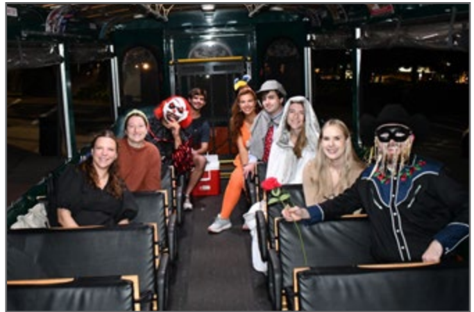
YLD Trolley Ride