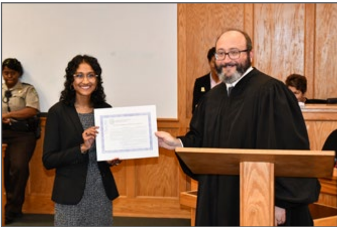
YLD Swearing In Ceremony